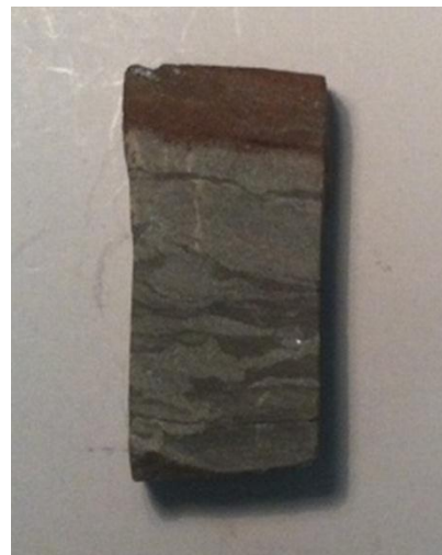
Fig. 1. An image of a carbonaceous mudstone analogue from Caithness, Northern Scotland. The red colour of the top layer indicates the presence of haematite-rich, oxidised material.

Flight-representative instrumentation: Raman spectra were acquired from the sample using instrumentation representative of RLS. The spectrometer used was equipped with a 100 mW, 532 nm laser with a footprint of <200 \mu\text{m} . The instrument used a thermoelectrically cooled CCD detector and was capable of a maximum spectral resolution of 10 \text{cm}^{-1} over its spectral range from 200 to 3400 \text{cm}^{-1} .